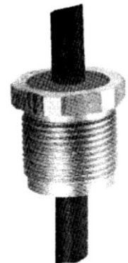
BS 162... plug-in type